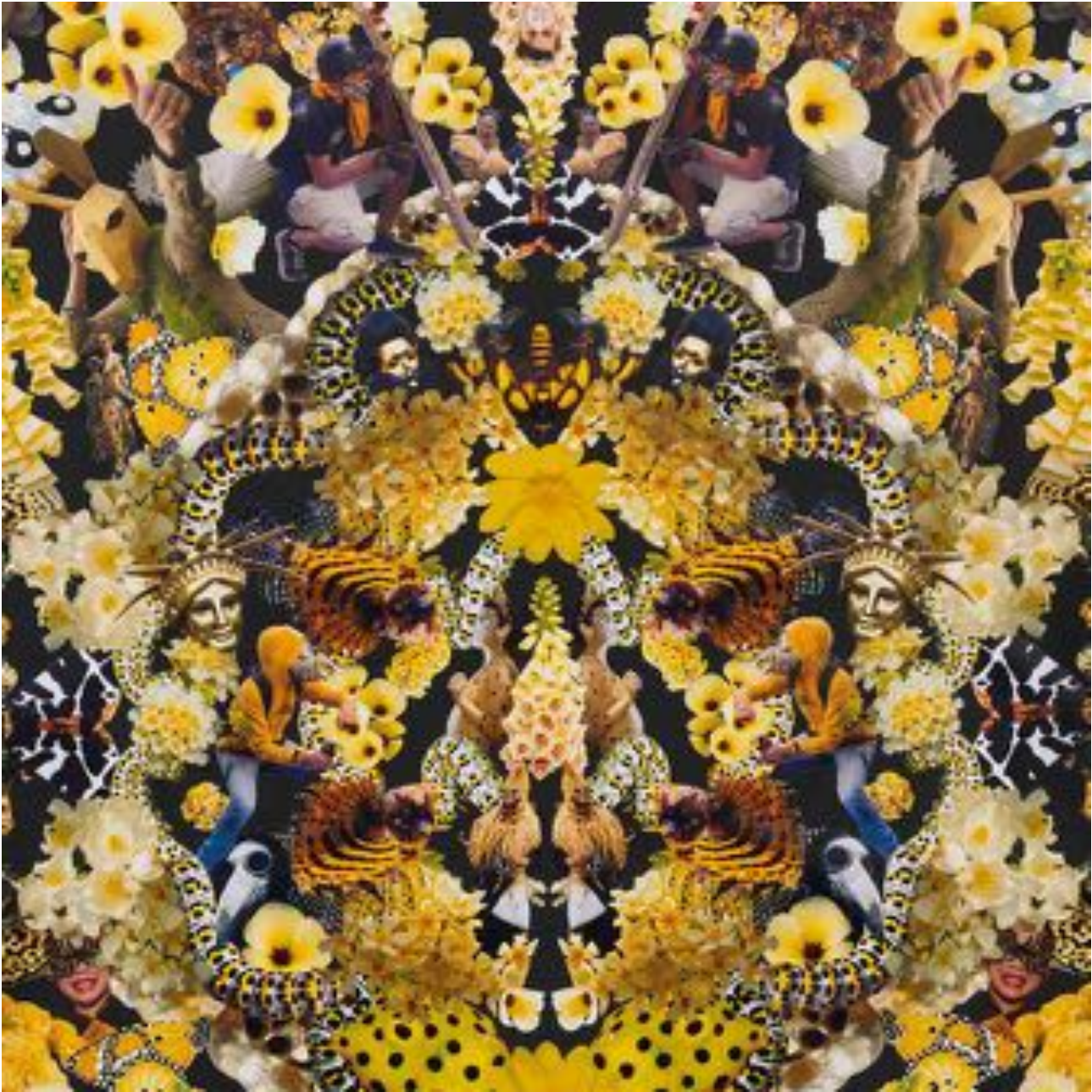
Jemima Wyman, Flourish (No. 7) [working title], 2019, detail; hand-cut photos on paper, 132 x 101.5cm; courtesy the artist; Commonwealth and Council, Los Angeles; Milani Gallery, Brisbane; and Sullivan+Strumpf, Sydney and Singapore