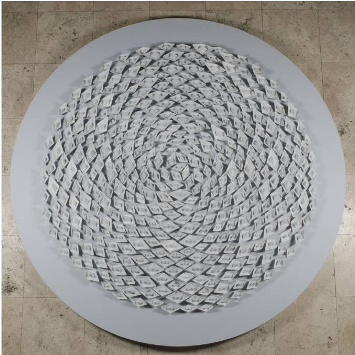
Paper Armada.