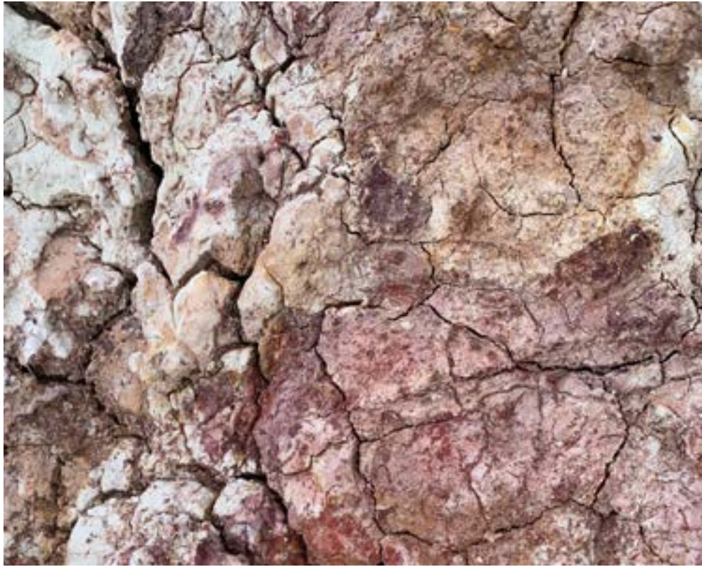
Bendalong, Yuin Country, 2022.